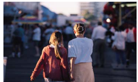
Let's Go Shopping!

plus an entry to a chance to win a $500 gift card. Living Grace Home benefits by selling these coupons for $5 each. If you want a book of coupons or would like to sell them at your business or church, please call 702-212-6472.